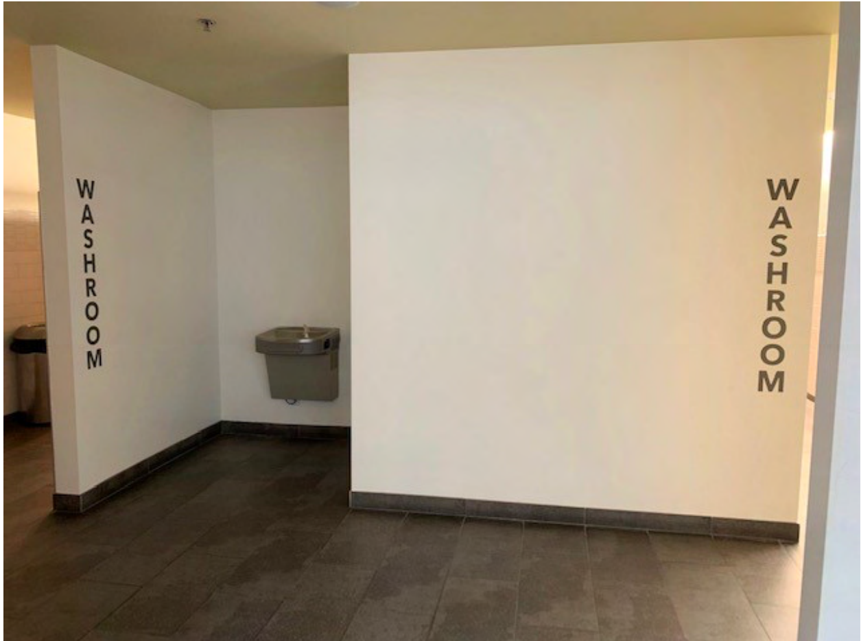
Image Description: A photo of the entrance to the washrooms at PTE. A water fountain is between the two doorways. There are not doors, just doorways.

There are two (2) washrooms in the lobby of PTE, located to right as soon as you enter the lobby from the mall.