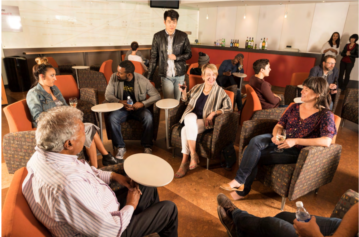
Image Description: A group of people sit in the lounge. A few people are standing. Some have drinks, others do not. There are many conversations happening between the people.

If you would like to purchase a drink you can access the lounge. The lounge is on the right, has a concession and some seating. The lounge is open to the lobby, but there is a track along the floor for the sliding doors that are often open, so please watch your step.