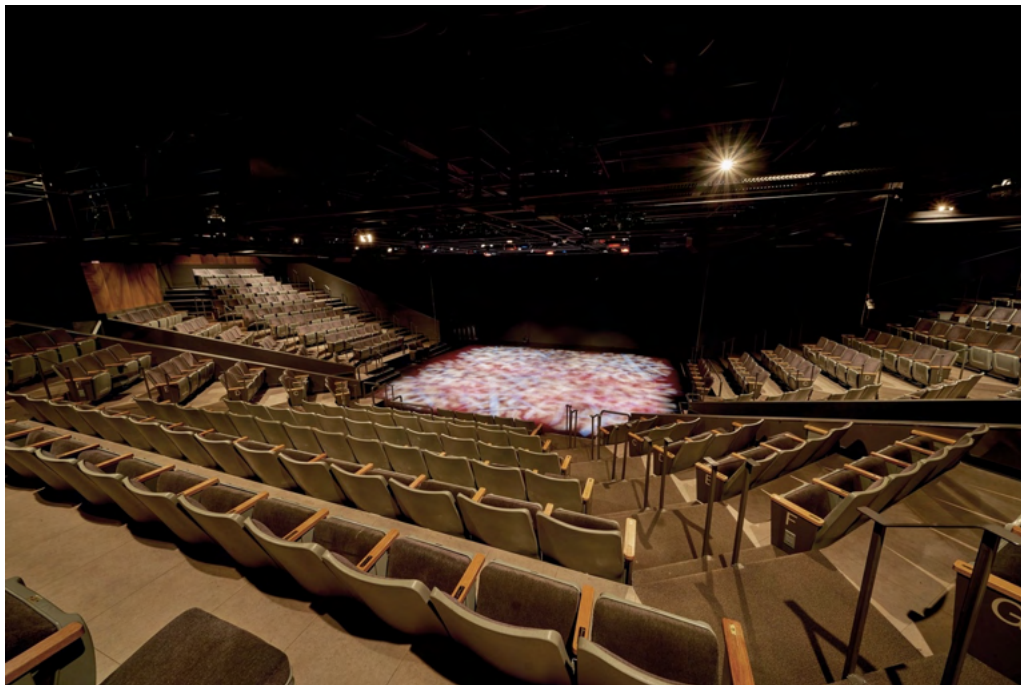
Image Description: A photo of the inside of the theatre from the back of the seating area looking down towards the stage.

There is a seating map online. It can be found here: https://www.ptc.mb.ca/plan-your-visit/theatre-maps