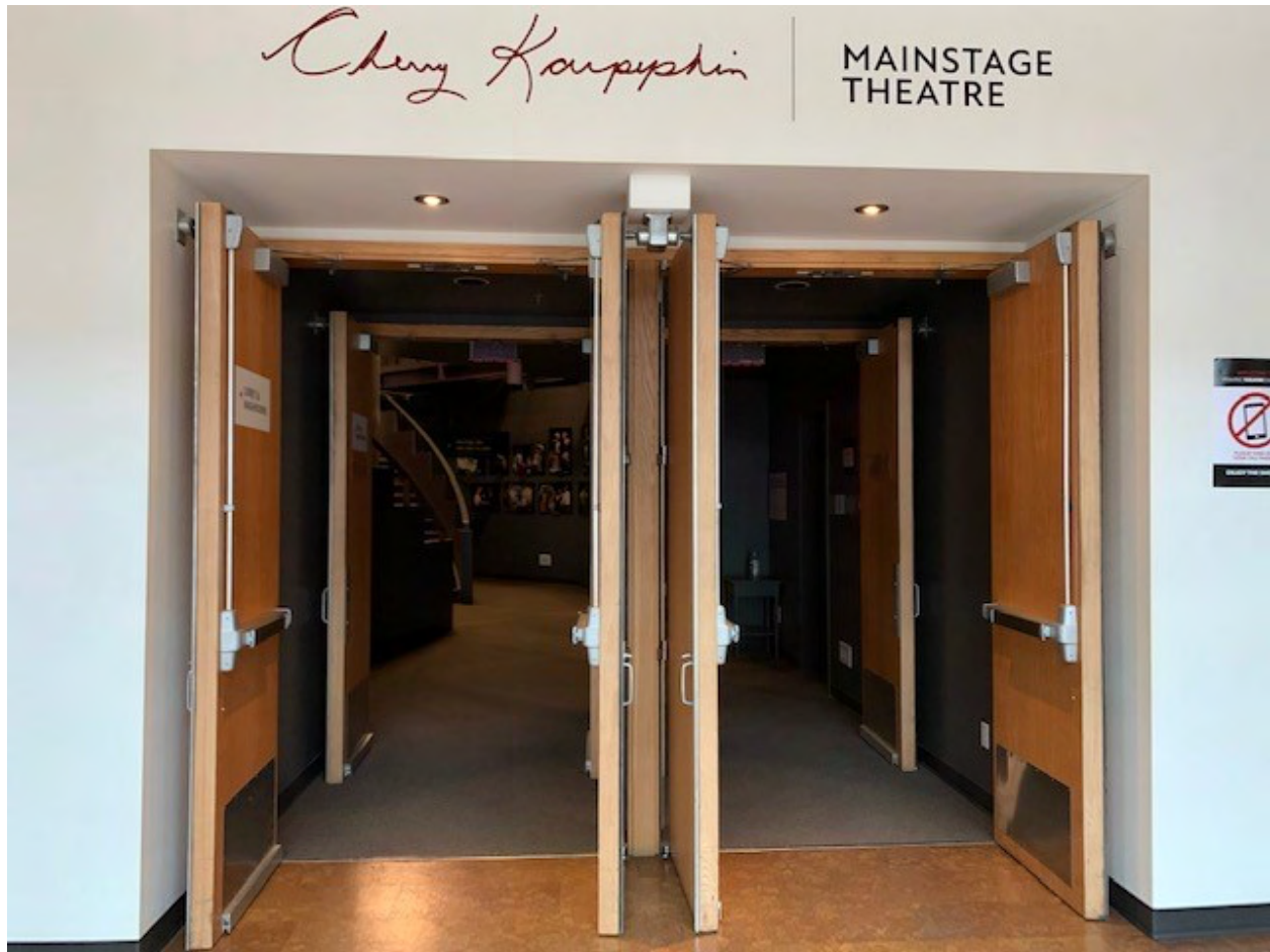
Image Description: The doors to the Cherry Karpyshein Mainstage Theatre are open. on the left, through the doors, part of the staircase up to the seats is visible.

The Cherry Karpyshein Mainstage Theatre has 323 seats.