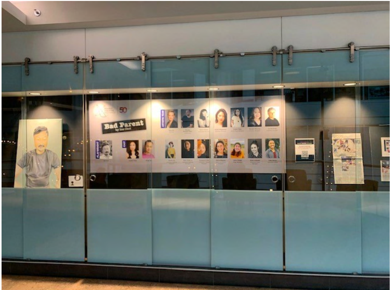
Image Description: The display case in the lobby. It contains photos and information about shows. In this photo the materials are for the show Bad Parent.

After the washrooms, on the right, is a display area that has the headshots (photos) of the actors and some information about the play.