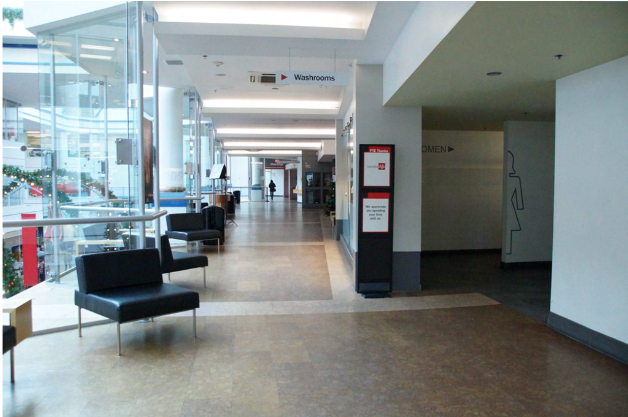
Image Description: A photo of the lobby of PTE. It is long like a hallway and access to washrooms, the lounge and both theatres is on the right.

The lobby is long and access to washrooms, the lounge, the Colin Jackson Studio, the café and the Mainstage will all be on the right. In the evening, the lighting in the lobby is soft and indirect.