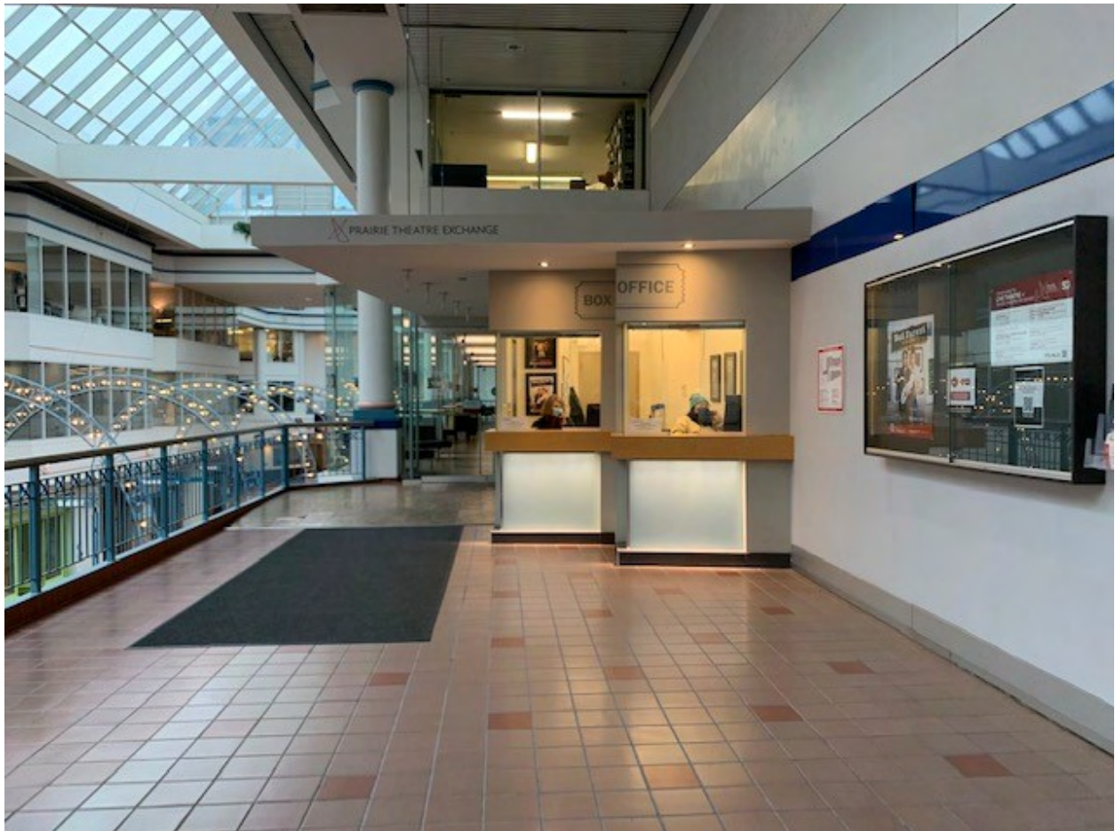
Image Description: A photo of the Box Office from the mall. The two wickets are on the right as you approach the theatre. The lights are on and people are inside ready to serve customers.

When you approach the theatre, you will first come to the Box Office. There are two box office wickets (desks or service areas). Each wicket will have its own line. Both wickets will be on your right. If you already have your tickets, there is no need to stop at the Box Office or wait in the Box Office line-up.